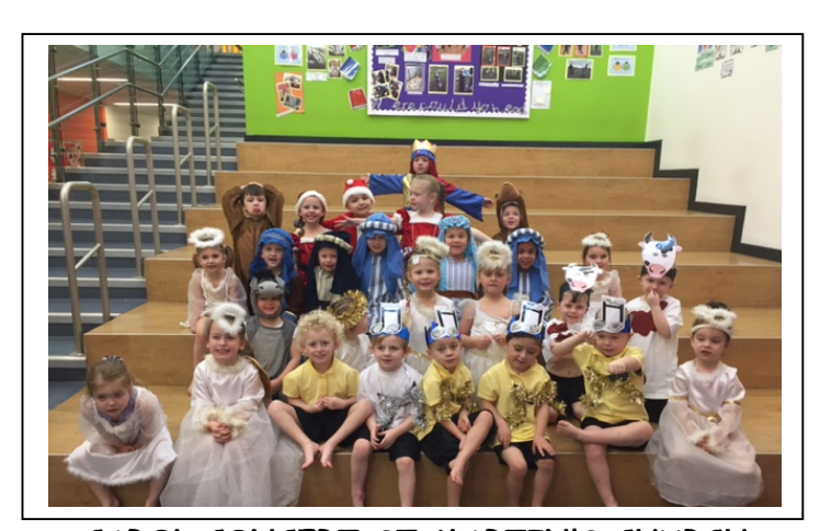
CAROL CONCERT ST MARTIN'S CHURCH

Well done to our Reception and Nursery Pupils, your production was fabulous. Clear voices, lovely dancing and brilliant singing. Fantastic!